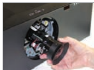
Easy to change lenses.