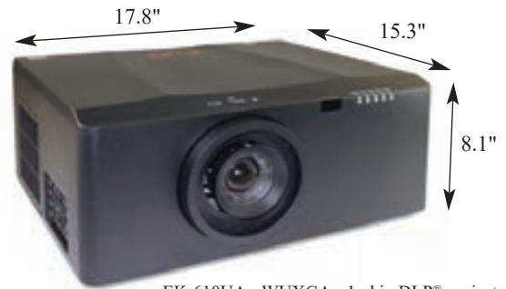
EK-610UA • WUXGA • 1-chip DLP® projector. EK-611WA • WXGA • 1-chip DLP® projector.