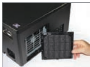
Handy access to air filter.

Includes a full complement of connections, including network control.