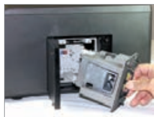
Easy to change long-life lamp.