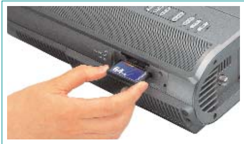
Three Memory Card Slots