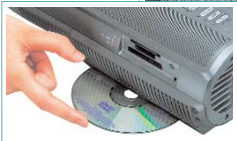
Built-in DVD Player