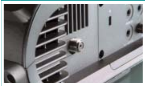
Built-In TV Tuner