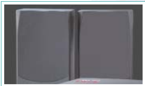
Optional Wireless Speakers