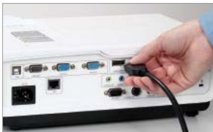
Connect and project.