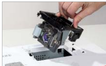
Easy to change long-life lamp.