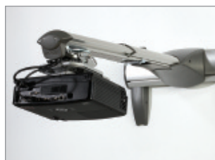
Fill a 60" wide screen from 38".