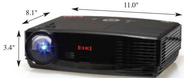
EIP-XSP2500 • XGA • 1-Chip DLP® Projector.