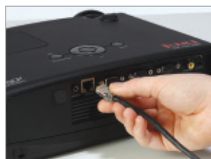
Just connect and project.