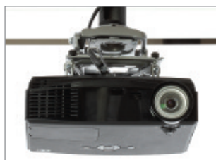
Easily mounts to ceiling.