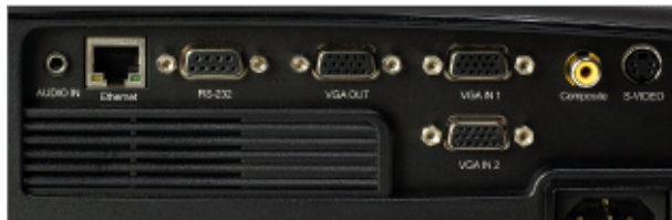
Ready to connect and project.

0.62:1 Throw Ratio. Fill a 60" wide screen from 38". Perfect for classroom interactive whiteboard use. Great for "corner-of-the desk" presentations.