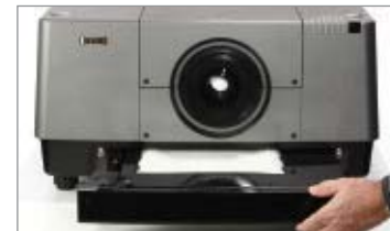
Air filter lasts up-to 13,500 hours.

Built-in complement of professional inputs, and room for more. Choose from SD/HD-SDI, Dual-Link SDI, VGA/DVI and 5BNC/S-Video modules.