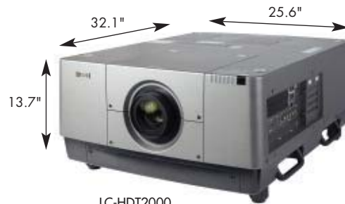
LC-HDT2000 (Shown with optional lens)

Vivid Colors with the 3LCD+One Imaging Engine High Contrast from Durable Inorganic LCD Panels Hot-Swappable Lamps, so The Show Can Go On