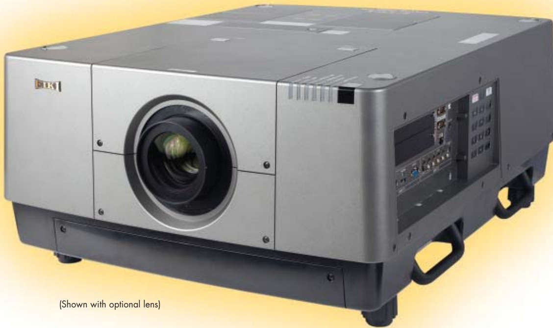
(Shown with optional lens)