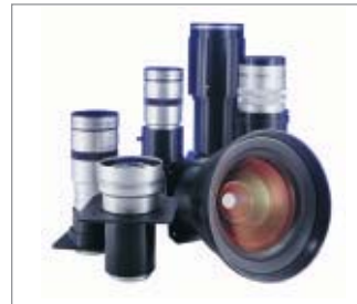
Broad selection of lenses.