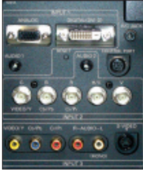
Full array of connections: just connect & project.