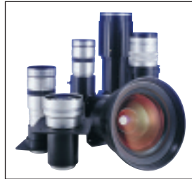
Range of wide angle and telephoto lenses are available to satisfy a variety of projection requirements.