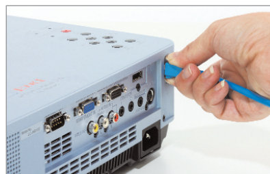
Built-in RJ-45 LAN port.