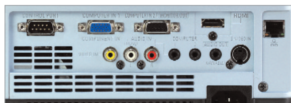
Just connect, and project.