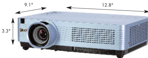
LC-WB100 - WXGA "Brilliant" Series Projector.