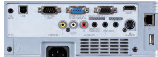
Just connect, and project.