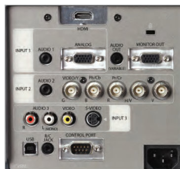
Just connect, and project.