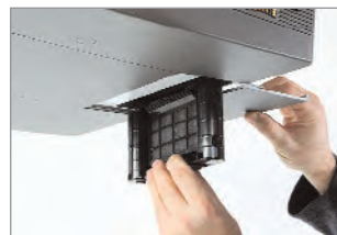
Up to 13,000 hours of use between air filter changes.