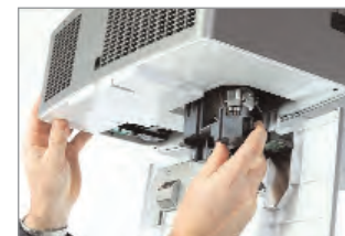
Up to 6,000 hours of use between lamp changes (2).