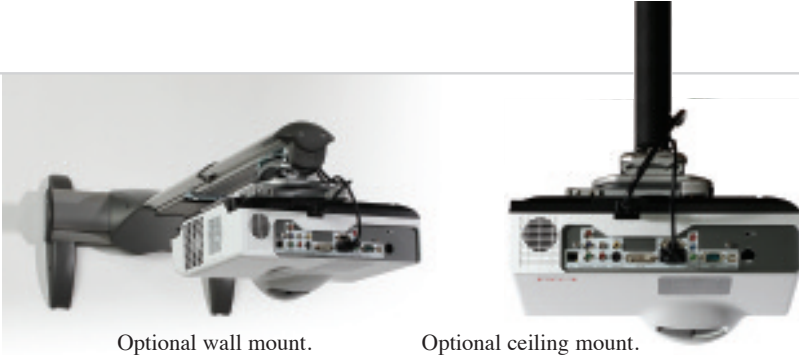
Optional wall mount.