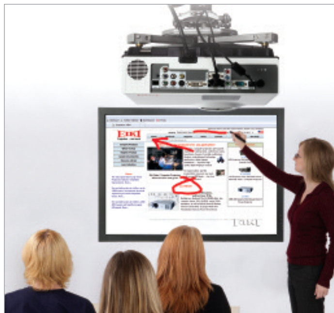
Simple and user-friendly interactive function makes it easy for you to handwrite and draw anything on screen.