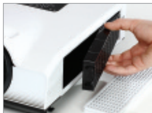
Side-accessed long life air filter.