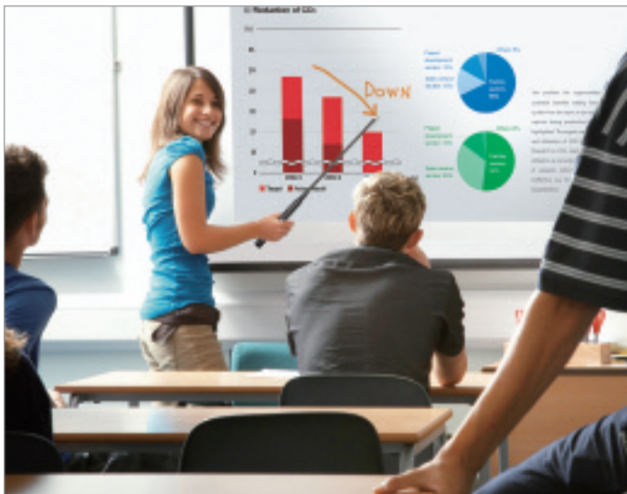
Interactive function permits real-time annotation on projected image. Pen and Pointer function as both writing instruments and computer mouse.