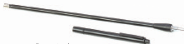
Pen and pointer.