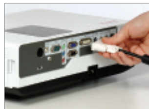
Just connect and project.