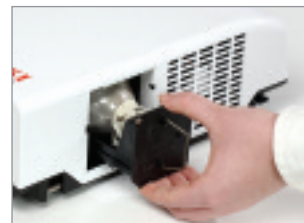
Side-accessed long life lamp.