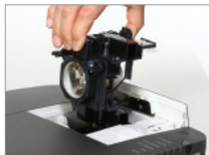
Easy lamp change.