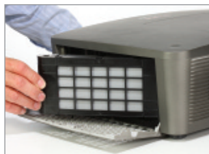
Replaceable air filter cartridge.