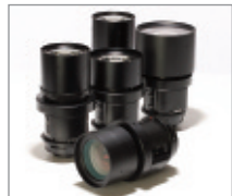
Range of wide angle and telephoto lenses.