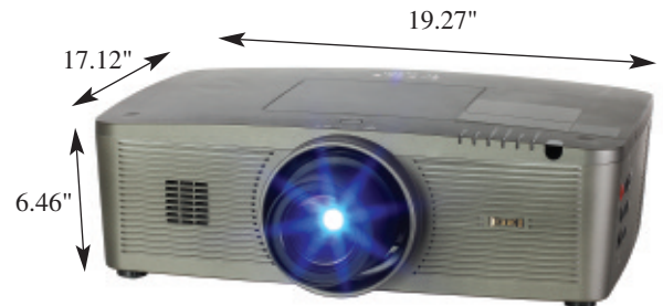
LC-WXL200A • WXGA • 3LCD projector. (Dimensions shown indicate projector with standard lens).