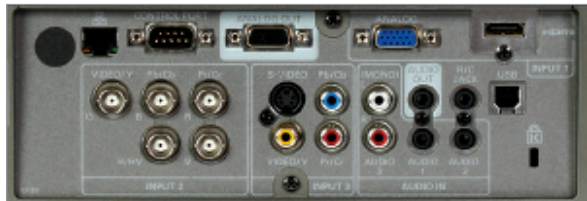
Includes a full complement of connections, including network control.

High Contrast Durable Inorganic LCD Panels. Cost-Effective Large Venue Performance. Crestron RoomView™ & AMX Device Discovery Technology.