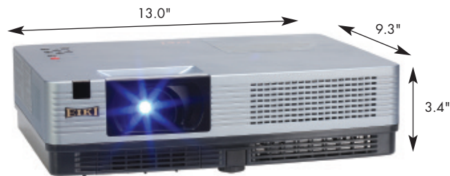
LC-XBL20 - XGA "Brilliant" Series Projector.

EIKI® is a registered trademark of Eiki International, Inc.