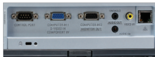
Just connect, and project.