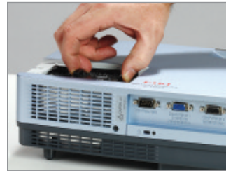
Top-accessed lamp compartment.