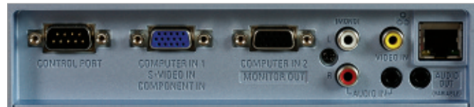
Ready to connect and project. Built-in LAN connection.