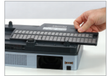
High efficiency air filter.