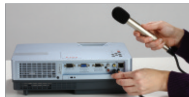
Mic input for P/A or Voice-over.

Hg Lamp Contains Mercury. Do not put in trash. Dispose-of-as Hazardous Waste, according to the laws in your jurisdiction.