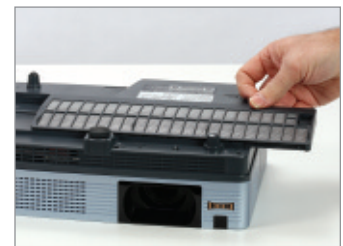
High efficiency air filter.