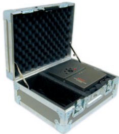
ATA case available.