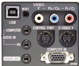
Full array of connections: just connect & project.