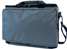
Soft carry bag included.