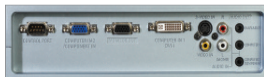
Just connect, and project.