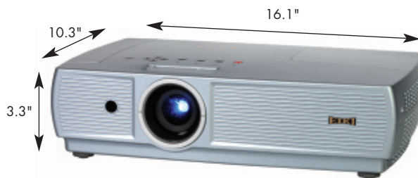
LC-XS25A - XGA "School" Series Projector.

EIKI® is a registered trademark of Eiki International, Inc.