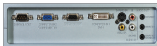
Just connect, and project.