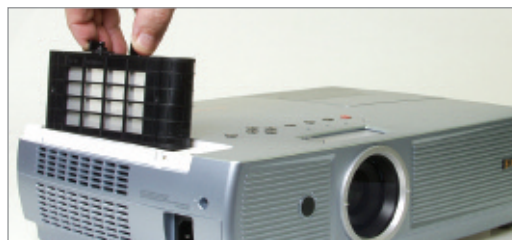
Replaceable air filter cartridge.