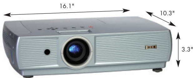
LC-XS30 - XGA "School" Series Projector.