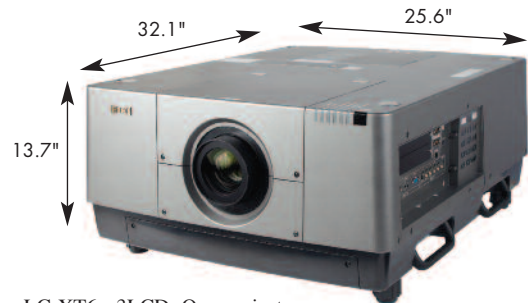
LC-XT6 • 3LCD+One projector (Shown with optional lens)