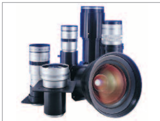
Broad selection of lenses.

Vivid Color with 3LCD+One Imaging. High Contrast from Durable Inorganic LCD Panels. Four hot-swappable lamps, so the show can go on.