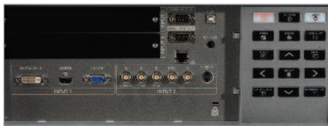
Built-in complement of professional inputs, and room for more. Choose from SD/HD-SDI, Dual-Link SDI, VGA/DVI and 5BNC/S-Video modules.

Replacement Lamps, Wideangle, Midrange and Telephoto Lenses, Additional DVI-D & Dsub15 Input Module, Additional 5BNC & S-Video Input Module, HD/SD-SDI Input Module, Dual-Link SDI Input Module, Replacement Air Filter, Smoke Resistant Filter Kit, Smoke Resistant Filter, ATA-Style Shipping Case with Wheels and Telescoping Handle, Ceiling Mount, Ceiling Post & Plate.