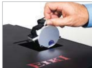
Easy access to color wheel.