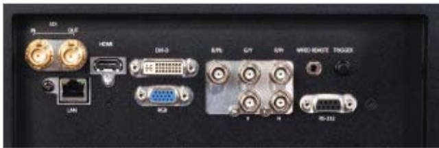
Includes a full complement of connections, including network control.

EIKI® is a registered trademark of EIKI International, Inc. Kensington® is a registered trademark of ACCO Brands Corporation.