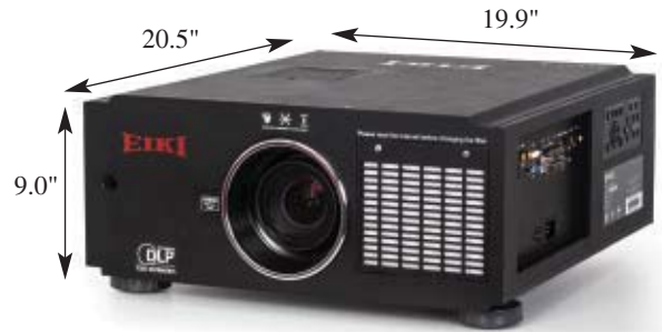
EIP-UHS100 • WUXGA projector.