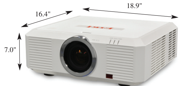
EK-502X • XGA • 3LCD projector.