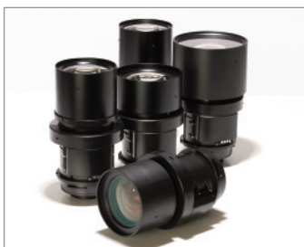
Range of wide angle and telephoto lenses.

Includes a full complement of connections, including network control.