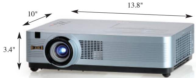
LC-WB200 • WXGA projector