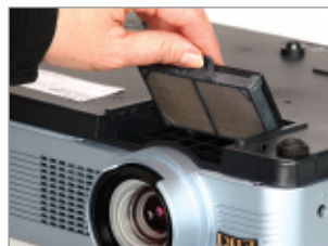
Handy access to air filter.