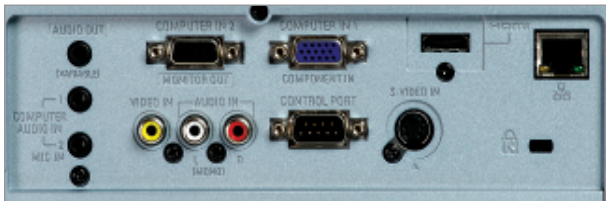
Includes a full complement of connections, including network control.

WXGA "Brilliant" Series with Long Life Lamp & Filter. UXGA & WXGA compatible. Interlace to Progressive conversion. Includes Picture-in-Picture and Picture-by-Picture functions.