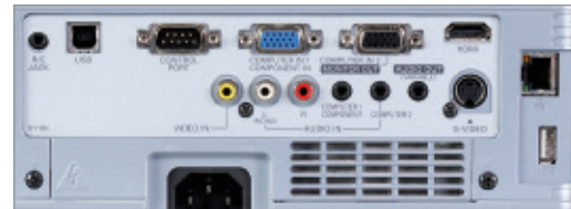
Just connect, and project.