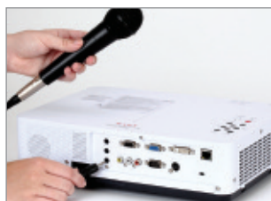
Built-in 10 Watt sound system.