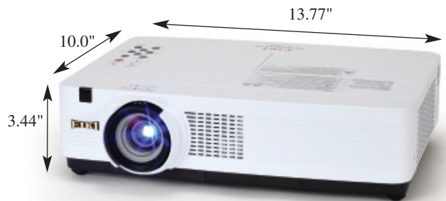
LC-XB250A • XGA projector