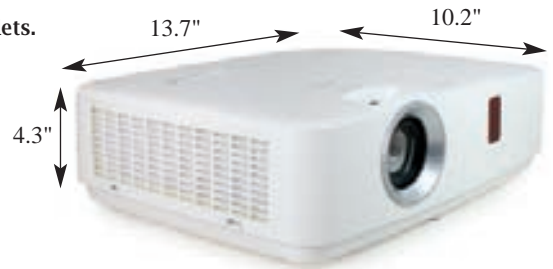
EK-101X • XGA • 3LCD projector. EK-102X • XGA • 3LCD projector.