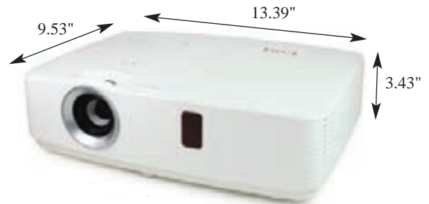
EK-103X • XGA • 3LCD projector.