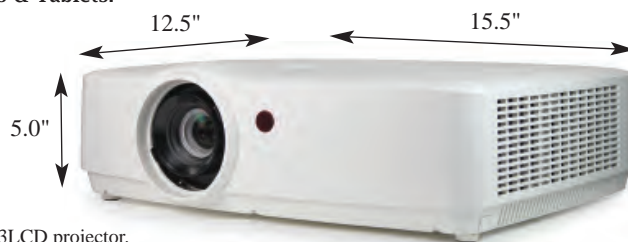
EK-305U • WUXGA • 3LCD projector.

Hg Lamp Contains Mercury. Do not put in trash. Dispose-of as Hazardous Waste, according to Local State or Federal Laws.