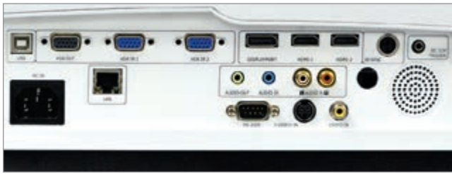
Includes a full complement of connections, including network control.

EIKI® is a registered trademark of Eiki International, Inc. Kensington® is a registered trademark of ACCO Brands Corporation. DLP® and DMD™ are trademarks of registered trademarks of Texas Instruments.