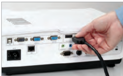
Connect and project.