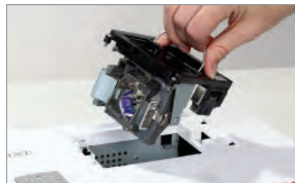
Easy to change long-life lamp.