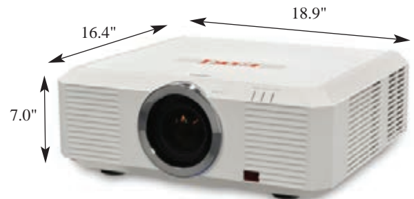
EK-502X • XGA • 3LCD projector.