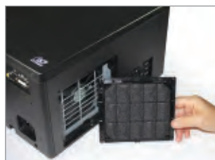
Handy access to air filter.

Includes a full complement of connections, including network control.