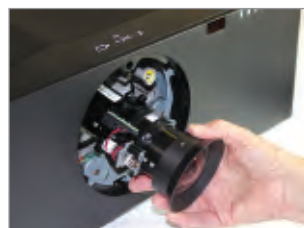
Easy to change lenses.