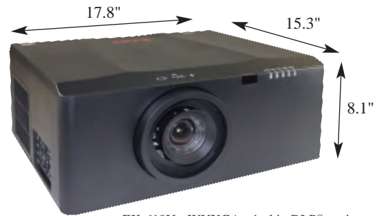
EK-610U • WUXGA • 1-chip DLP® projector. EK-611W • WXGA • 1-chip DLP® projector.