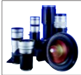
Range of wide angle and telephoto lenses are available to satisfy a variety of projection requirements.