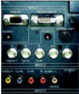
Full array of connections: just connect & project.