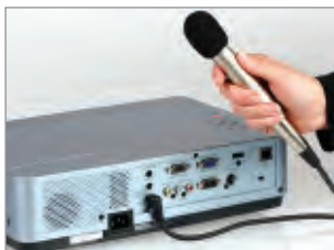
Built-in 10 Watt sound system.