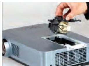
Easy to change long-life lamp.