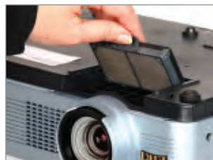
Handy access to air filter.