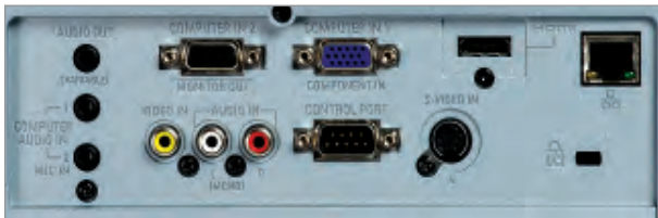
Includes a full complement of connections, including network control.

WXGA "Brilliant" Series with Long Life Lamp & Filter. UXGA & WXGA compatible. Interlace to Progressive conversion. Includes Picture-in-Picture and Picture-by-Picture functions.