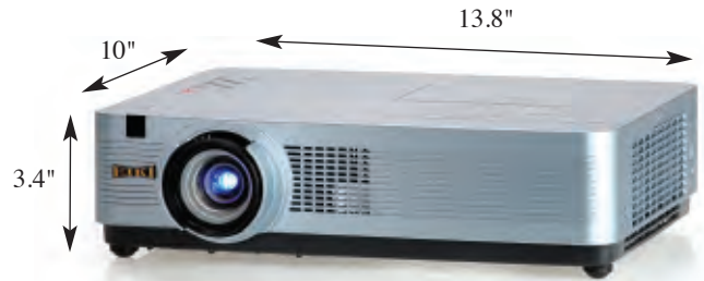
LC-WB200 • WXGA projector