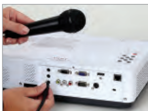
Built-in 10 Watt sound system.