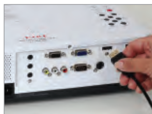
Connect and project.