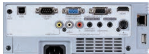
Just connect, and project.