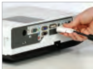
Just connect and project.