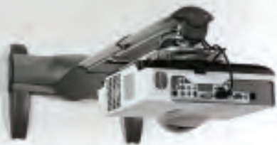
Optional wall mount.