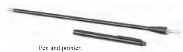
Pen and pointer.