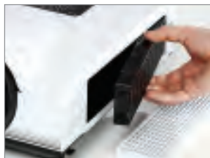
Side-accessed long life air filter.