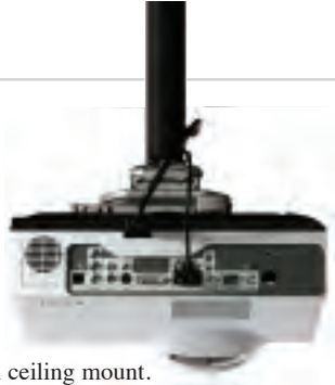
Optional ceiling mount.