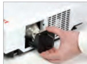
Side-accessed long life lamp.