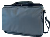
Soft carry bag included.